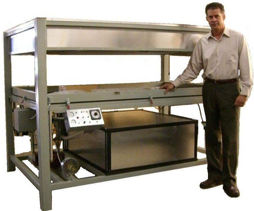
Many Shapes Can Be Easily Formed With the MultiVac

www.schultzform.com Email: info@schultzform.com